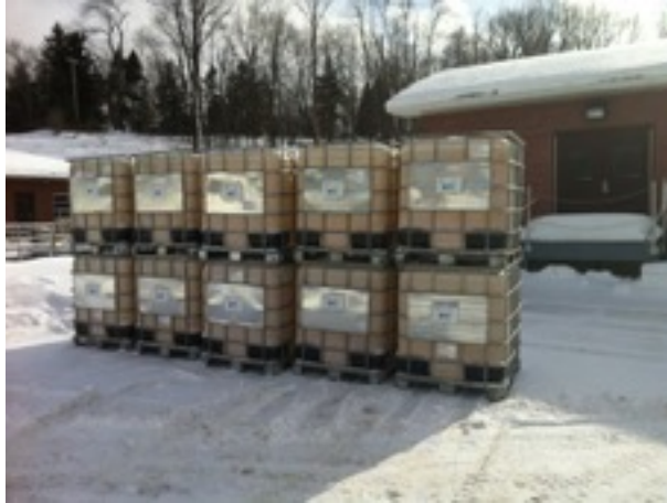
Figure 2. RE 100 totes awaiting use in the trial on a -25°F day