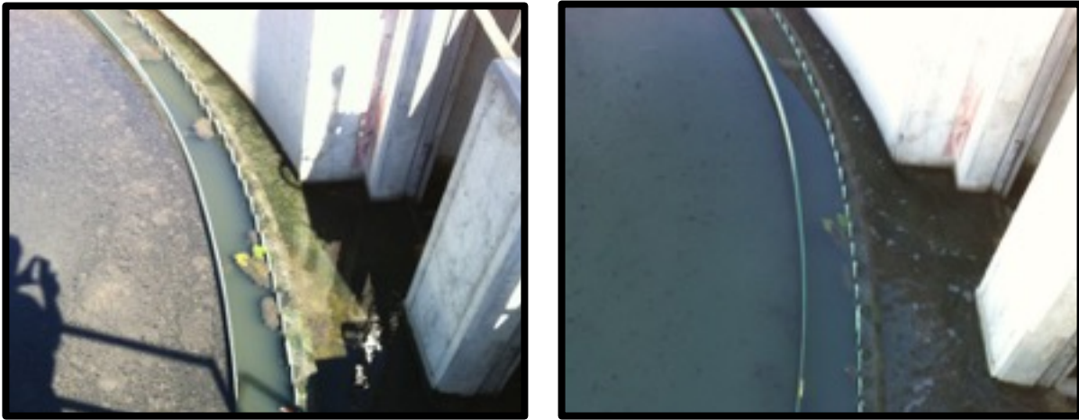
Figure 3: Secondary clarifier before (left) and after (right) introduction of RE 100

As shown in Figures 4(a) and 4(b) below, RE 100 successfully reduced phosphorus within the first month to meet permit limits. After only four days of RE 100 dosing, the phosphorus dropped from 1.5 ppm TP to below 0.5 ppm TP. PAC addition caused the aluminum in the effluent to rise dramatically over that of the influent (left half of Figure 4(a)). After one month of trial usage, the plant decided to switch over to RE 100. The plant is now using RE 100 exclusively to meet their TP and Al discharge permits. After several months of usage, plant management was able to optimize the process and reduce the total RE 100 dose in both clarifiers to 70 ppm v . Plant personnel are continuing to optimize and have reduced the dosage to even lower levels.