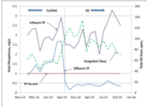
Figure 4(a). Total Phosphorus before and after SorbX